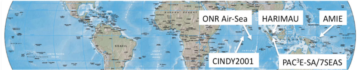
Figure 1 Global perspective and partner programs of CINDY2011/DYNAMO.